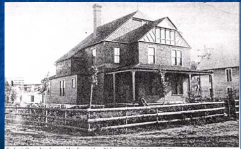
Edward Livingston Trudeau's Home, Saranac Lake, New York, 1890.