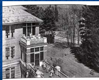
Care porches at Ray Brook, New York, (summer and winter).